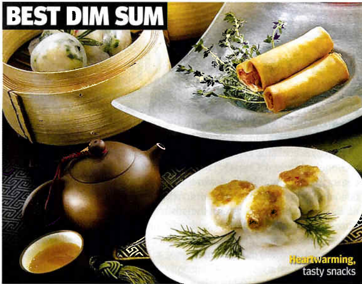
Heartwarming, tasty snacks